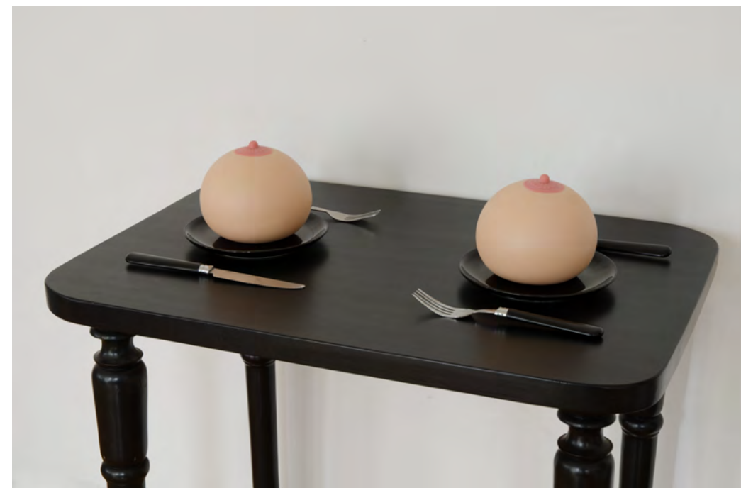
JANA ŽELIBSKÁ Pudding for Two, 2016 Installation, mixed media

Czechoslovakia – 25 years of passion – GANDY GALLERY VIENNA CONTEMPORARY (Booth C06) 21 September - 24 September 2017