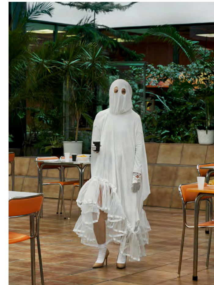
VENDULA KNOPOVÁ After Midnight Dress, 2016 Color photography, 54 x 70 cm