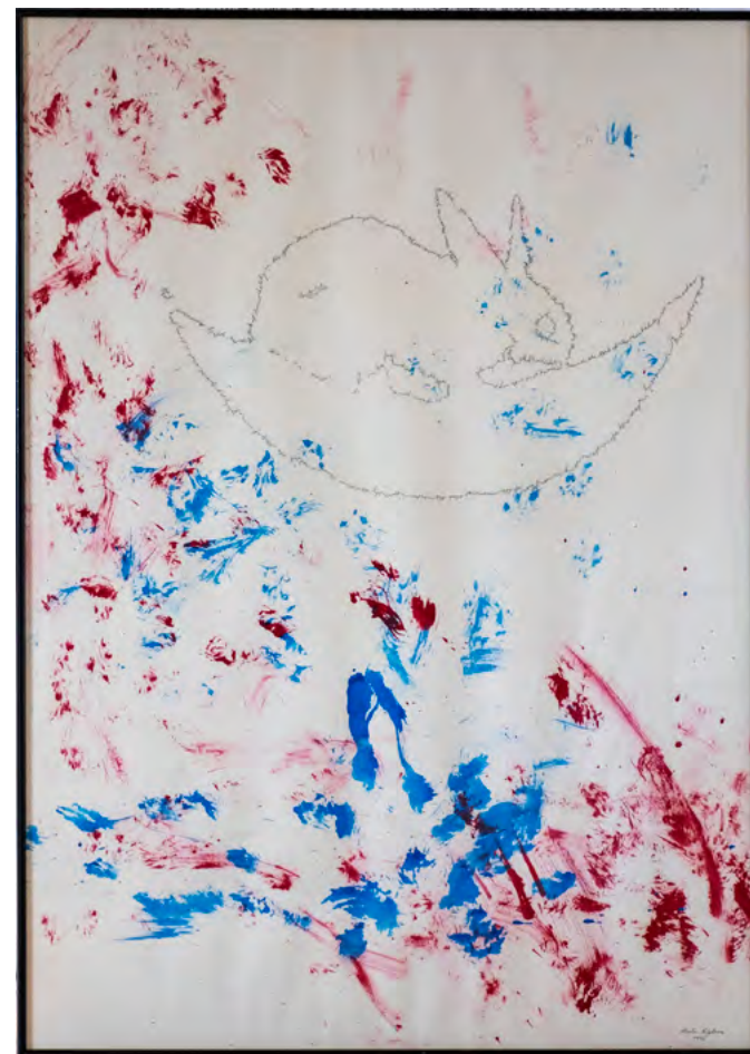
ZBYNĚK BALADRÁN FROM THE SERIES ATLAS OF TRANSFORMATION: ECOLOGY, 2009 Digital print on PVC, 60 x 42 cm Edition of 3